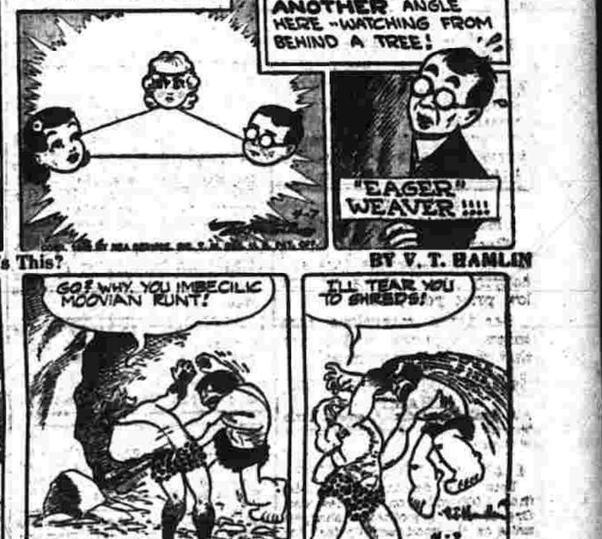
By V. T. Hamlin