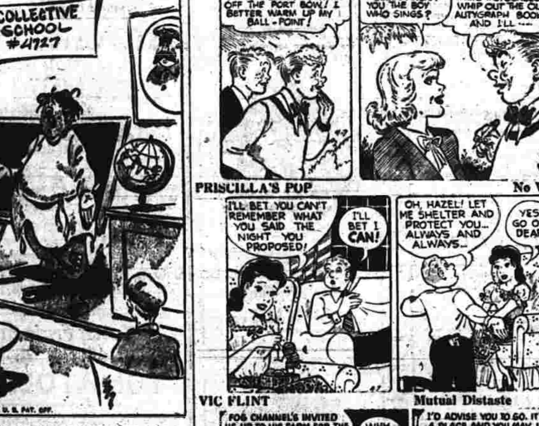
By Dick Turner