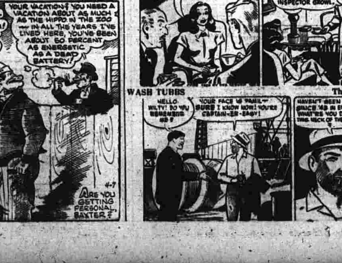
By Leslie Turner